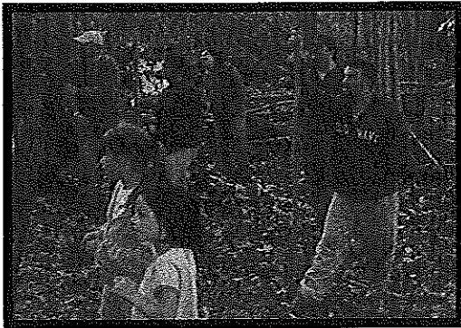
Despite losing to their parents at every game, the kids' jail was very full with parents at times.