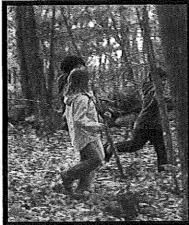
In hot pursuit of parents