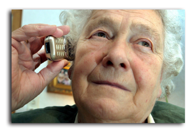
How Do I Register?

To register for this service, simply fill out the registration form and drop it off at the Standish Dispatch center located in the Town Municipal Building at 175 Northeast Road, Standish. If you are unable to drop off the form in person, you may arrange for a Volunteer to come pick it up by calling us at 207-774-1444, ext. 2100.